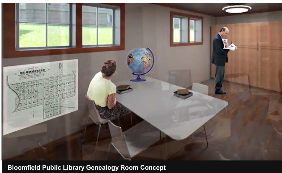
Bloomfield Public Library Genealogy Room Concept