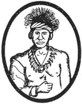
APPANOOSE HISTORICAL MARKER

The village of Albany was located about 1/2 mile south of the 4-corner intersection of Appanoose, Monroe, Wapello, and Davis Counties. An early settler from near Albany N.Y. is thought to have started the settlement. The area had been opened for homesteading and the abundance of deer, wild turkey, squirrels, and white oak timber attracted settlers. The settlement soon spread out, occupying the edge of appanoose and Davis Counties. In 1856 there were 40-50 homes and a two story hotel. The village was platted with 46 lots in 1850. Eventually there were two stores, a blacksmith shop, and a brick kiln added. There was a post office on the Davis County side known as Soap Creek. In 1856 it was moved to the Appanoose County side and renamed Albany. It was discontinued in 1902 with the mail going to Ash Grove in Davis County. No record exists of any school or church located in Albany. The nearest school was called Mt. Hope, about one mile S.W. of Albany. The Mormon Trail passed just north of Albany during the years 1846-1852. When the railroads were built in surrounding areas, they bypassed the hilly Soap Creek area and signaled the demise of Albany. Today most people have never heard of the town and all that remains is a remote well kept cemetery about 1/4 mile west of where Albany stood.