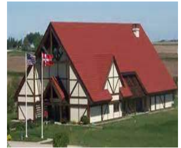
Danish Immigrant Museum in Elkhorn, Iowa.

The Danish Immigrant Museum, 2212 Washington Street, Elk Horn, Iowa, 51531, 712-764-7001, www.danishmuseum.org ,